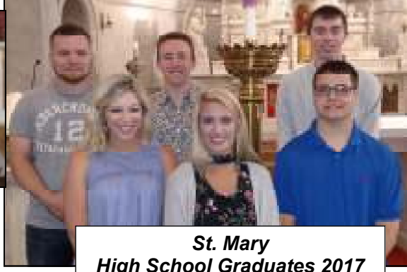
St. Mary High School Graduates 2017