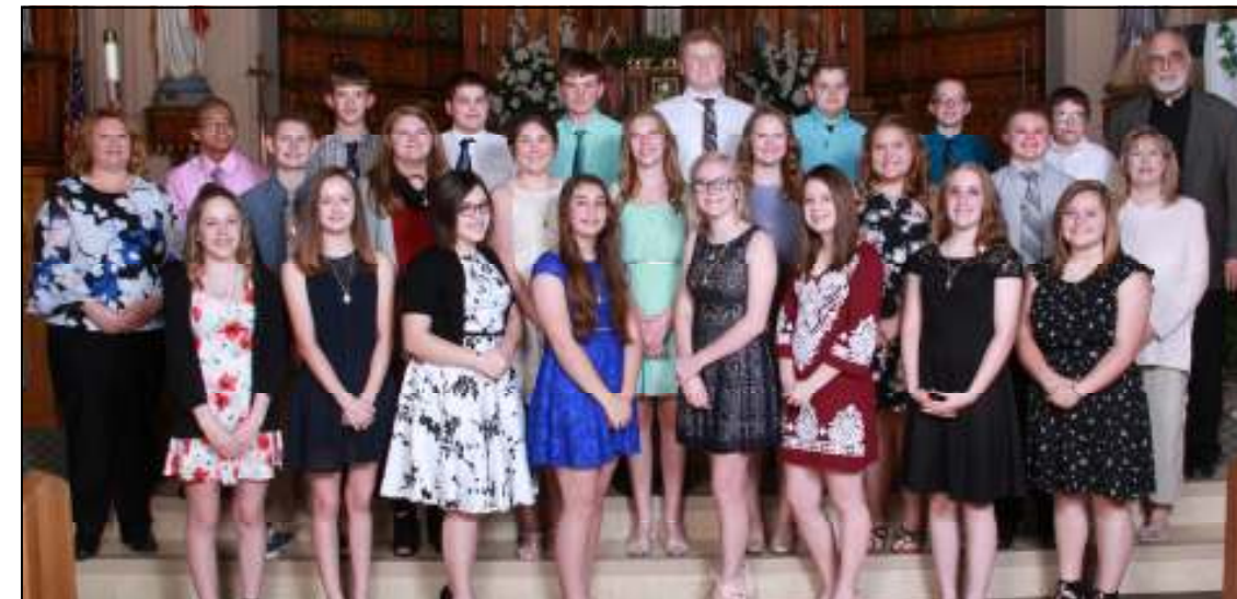
Confirmation May 2, 2017